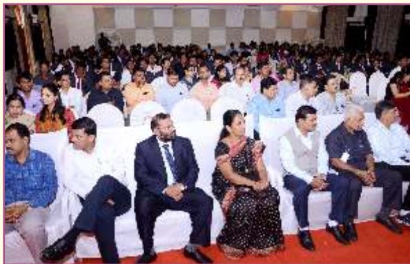
Audience at the Foundation Day Lecture