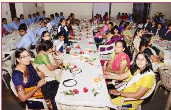
Teaching and Non-teaching staff at the 'At Home Function'