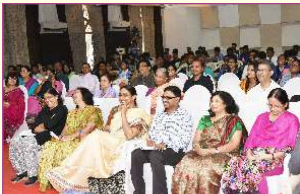
Audience at the Conference